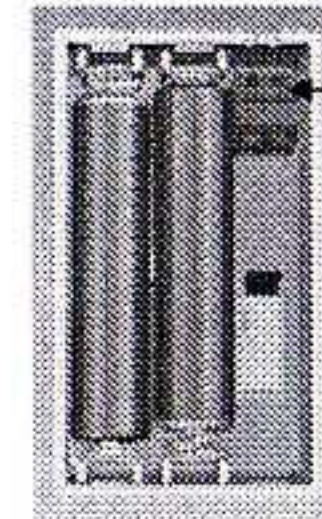
Terminal blocks for external wiring

The temperature function can be used without any further installation or configuration. The binary sensor function is available on the two terminal blocks inside the device. Please wire these terminals to the external switch that can be used. Beware: You must not power the two terminals. They are only connected with an external switch.